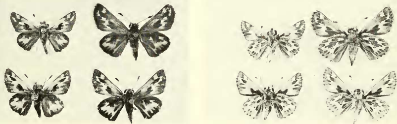
Fig. 2. Dorsal and ventral surfaces of early spring and late fall P. s. sabuleti from the Central Valley, approaching the phenotype of P. s. tecumseh .